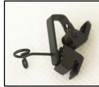
HC-11V-** Holder Clip / Vertical