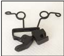
HC-11W-** Holder Clip Double for 2 COS-11