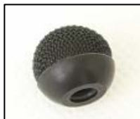
WSL-11 Large Metal Windscreen Black only