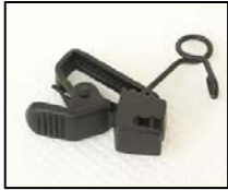
HC-11-** Holder Clip