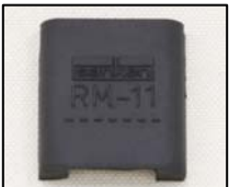
RM-11-BK Rubber Mount black