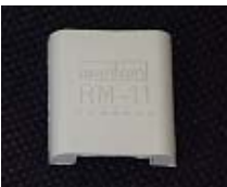
RM-11 Rubber Mount beige