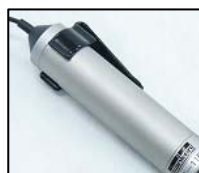
BELTCLIP for COS-11BP Belt clip parts for COS-11BP

Product features and specifications are subject to change without notice