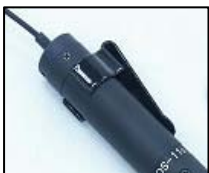
BELTCLIP for COS-11 Belt clip parts for COS-11