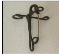
PIN-11 Safety Pin