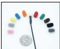
FW-11 Foam Windscreen (11 colors in 1 pack)