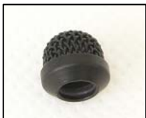
WS-11-** Metal Windscreen