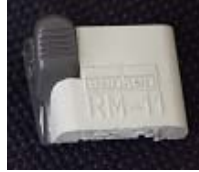
RM-11C Rubber Mount with holder clip/beige only